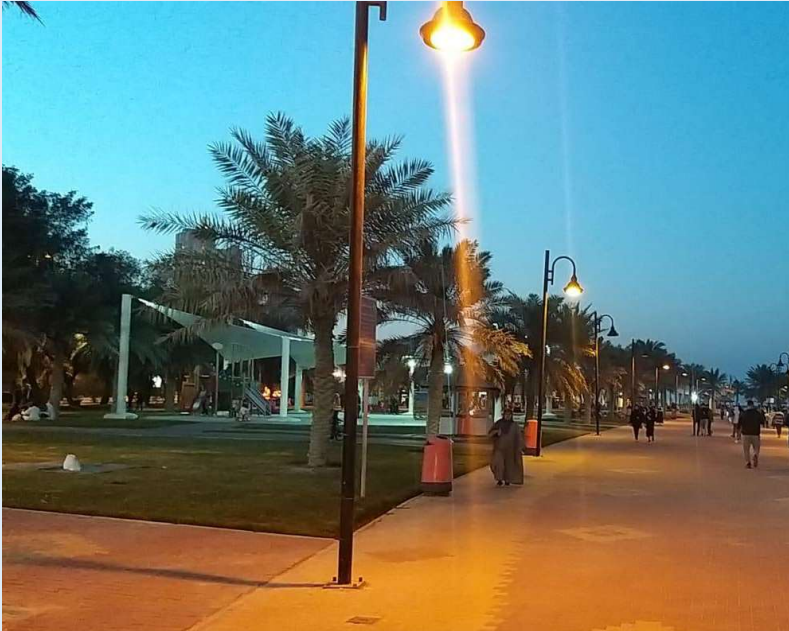
Al Fintas Beach